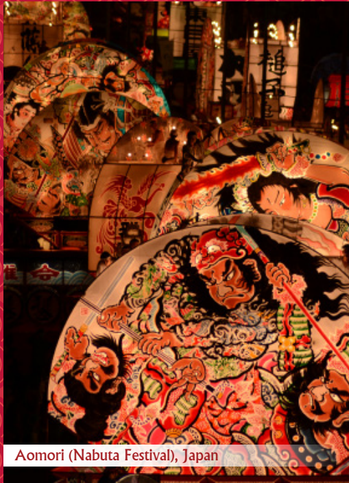
Aomori (Nabuta Festival), Japan