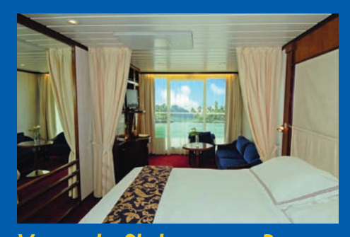
Veranda Stateroom - B Decks 7.8 Stateroom: 249 – 256 sq. ft. Veranda: 47 – 56 sq. ft.