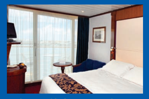
Balcony Stateroom - C,D Decks 6, 7 Stateroom: 202 sq. ft. Veranda: 37 sa. ft.