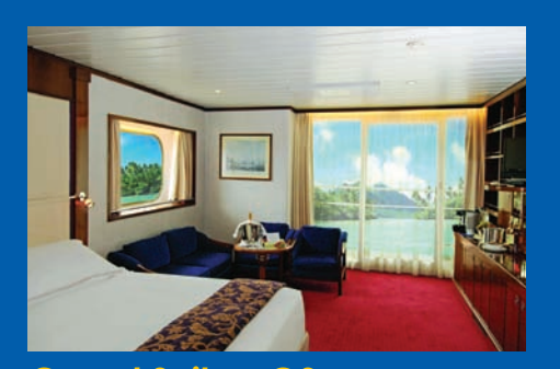
Grand Suite - GS Deck 8