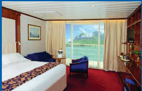
Veranda Suite - A Deck 7 Suite: 296 – 300 sq. ft. Veranda: 53 – 58 sq. ft.