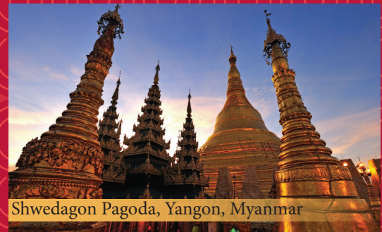
Shwedagon Pagoda, Yangon, Myanmar