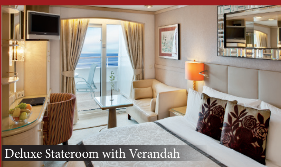
Deluxe Stateroom with Verandah