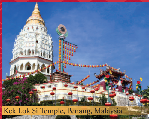
Kek Lok Si Temple, Penang, Malaysia