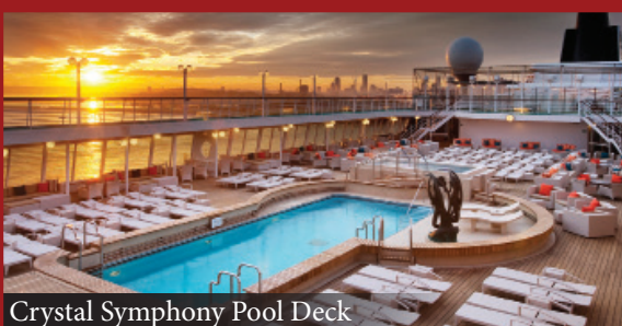
Crystal Symphony Pool Deck