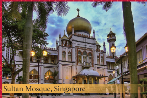
Sultan Mosque, Singapore