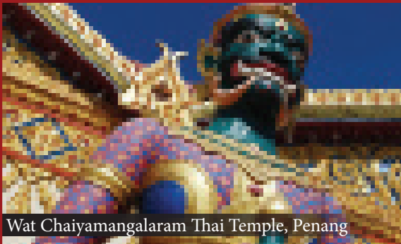
Wat Chaiyamangalaram Thai Temple, Penang

From pagodas to palaces, the Far East is blessed with exquisite natural beauty, deep spiritual richness and compelling historical importance.