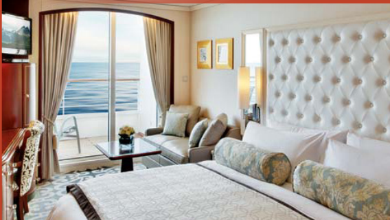
Deluxe Stateroom with Verandah