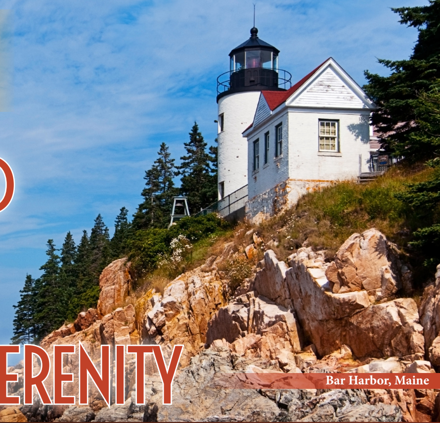
Bar Harbor, Maine

Montreal | Quebec City | Bar Harbor | Boston | New York October 17 - 25, 2016