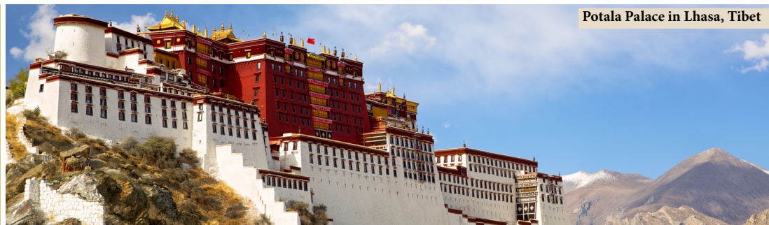
Potala Palace in Lhasa, Tibet

Healthcare in the Far East—Medicine for the Masses This Seminar is planned for up to 16 Continuing Education Credit Hours