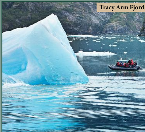
Tracy Arm Fjord