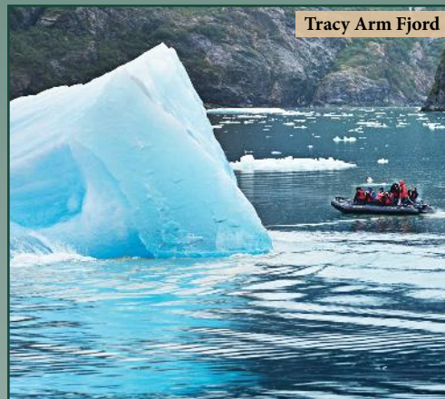
Tracy Arm Fjord