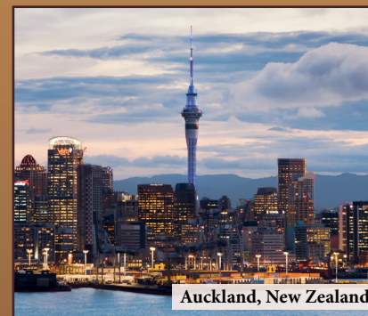
Auckland, New Zealand