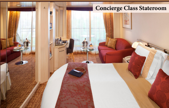
Concierge Class Stateroom