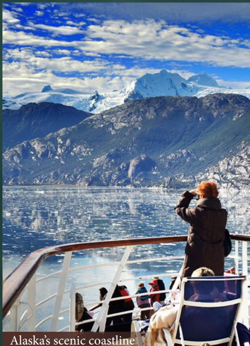
Alaska's scenic coastline