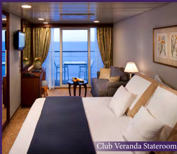
Club Veranda Stateroom