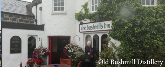
Old Bushmill Distillery