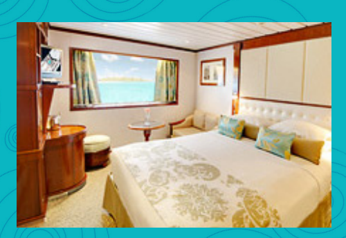
Window Stateroom - E Deck 4 Picture window Stateroom: 200 sq. ft.

Porthole Stateroom - F Deck 3 2 portholes instead of window Stateroom: 200 sq. ft.