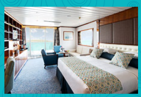
Grand Suite - GS Deck 8 Suite: 332 sq. ft. Veranda: 197 sq. ft.