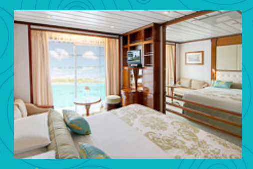
Balcony Stateroom - C, D Decks 6, 7 Stateroom: 202 sq. ft. Veranda: 37 sq. ft.