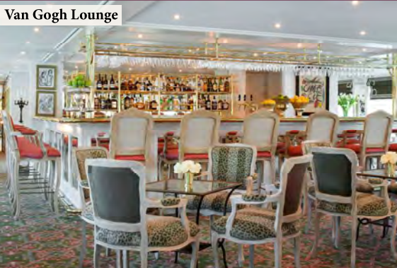
Van Gogh Lounge