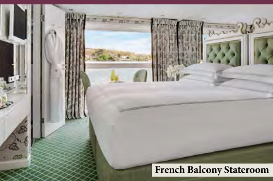
French Balcony Stateroom

Contact your PES Travel Coordinator for details on the Pre and/or Post-Cruise Packages.