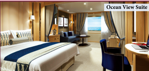
Ocean View Suite

All Ocean View and Balcony suites are 277 square feet with a queen size or two twin beds, seating area with couch and chair, vanity desk, walk-in closet, flat screen TV with DVD, minibar, safe, bathroom with double sink granite countertop, full-size tub/shower combination, and hairdryer, plus slippers and a waffle-weave bathrobe.