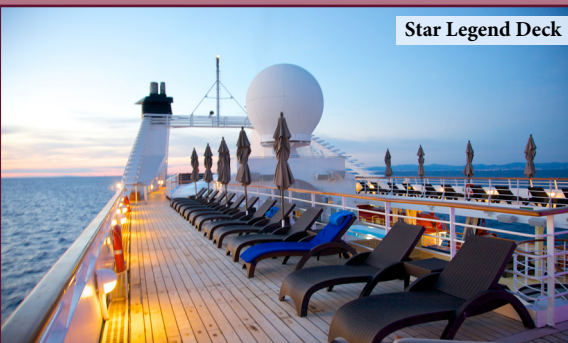
Star Legend Deck