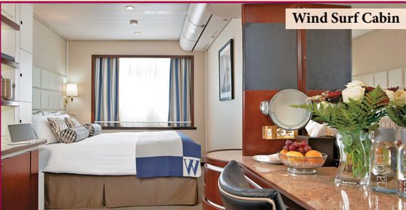
Wind Surf Cabin

All ocean-view cabins feature a large picture window, queen-size bed or two twin beds, vanity desk, efficient closet space, minibar, safe, flat-screen TV, bathroom with shower and granite countertop, L'Occitane toiletries, hair dryer, bathrobe, and slippers.