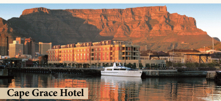
Cape Grace Hotel