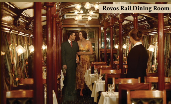
Rovos Rail Dining Room