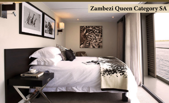
Zambezi Queen Category SA

Relive the romance of a bygone era traveling on the world's most luxurious and historic train. Enjoy exquisite cuisine and fine South African wines in the charming Victorian dining car before retiring to your sleeper car with an en-suite bathroom.