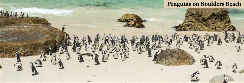
Penguins on Boulders Beach