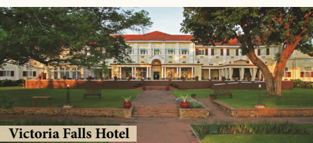
Victoria Falls Hotel