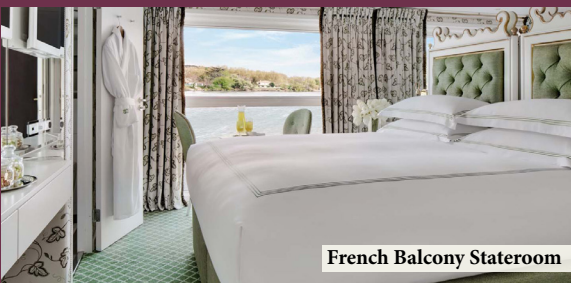
French Balcony Stateroom

Lavishly appointed riverview staterooms and suites have handcrafted Savoir® of England beds draped in 100% Egyptian cotton linens with a menu of pillow choices, generous built-in closets, a marble bathroom with L'Occitane en Provence bath and body products, bathrobes and slippers, flatscreen TV, an individual climate-control thermostat, and free Wi-Fi.