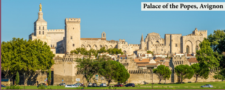
Palace of the Popes, Avignon