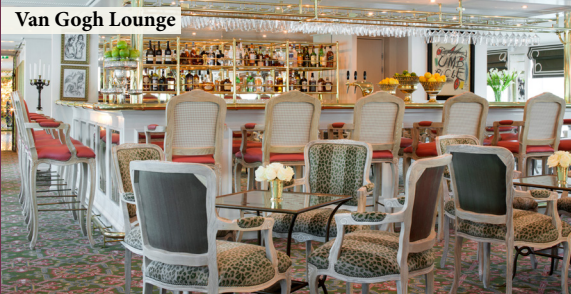
Van Gogh Lounge