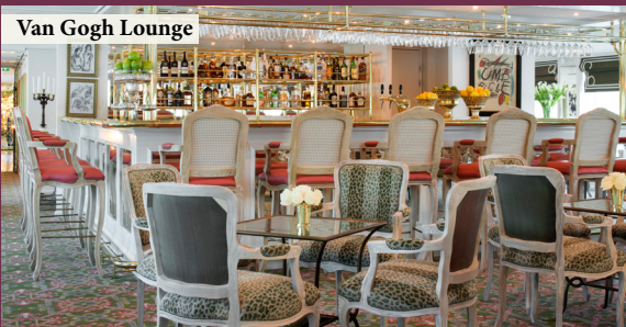
Van Gogh Lounge