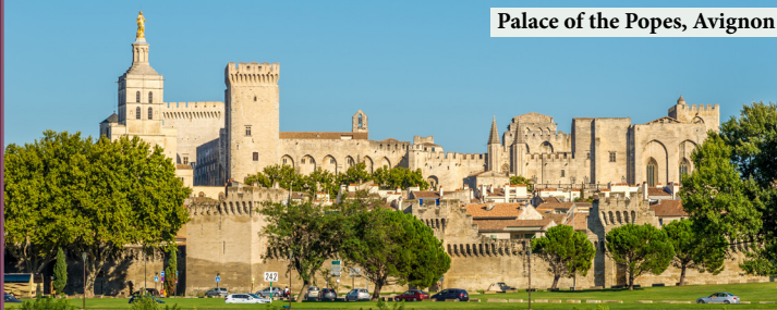
Palace of the Popes, Avignon