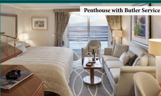
Penthouse with Butler Service

The journey of your dreams awaits with Crystal... Where Luxury is Personal.