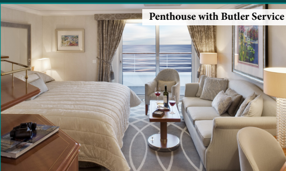
Penthouse with Butler Service

The journey of your dreams awaits with Crystal... Where Luxury is Personal.