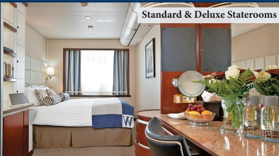
Standard & Deluxe Staterooms

All ocean-view cabins feature a large picture window, queen-size bed or two twin beds, vanity desk, efficient closet space, minibar, safe, flat-screen TV, bathroom with shower and granite countertop, L'Occitane toiletries, hair dryer, bathrobe, and slippers. The spacious suites add a sitting area and additional luxurious amenities.