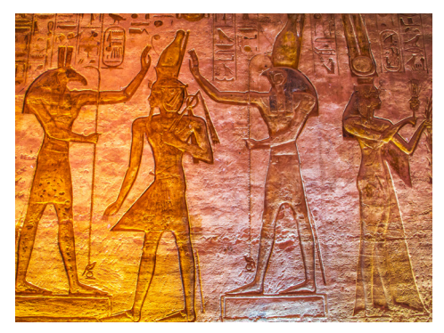
Stone carvings, Temple of Abu Simbel

Buried for years in the sand until being discovered in 1813, the temple was built along the banks of the Nile River and had to be moved with the creation of the Aswan High Dam. In a remarkable feat of engineering, the temple complex was dismantled in 1960 and rebuilt on a higher hill in Lake Nasser, one of the largest manmade reservoirs in the world.