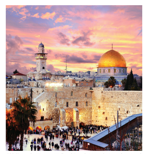
Old City at the Western Wall and Temple Mount in Jerusalem, Israe