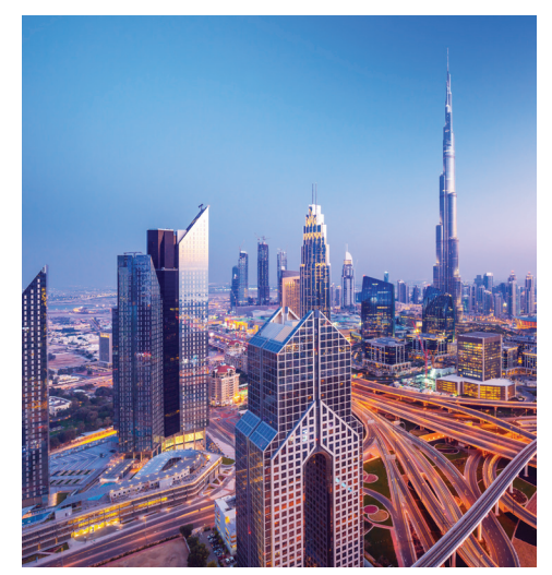
Dubai skyline at sunset, United Arab Emirates